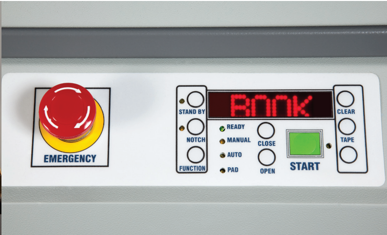
User-friendly control panel